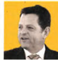
Richard Wood Plaza Construction